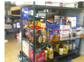
The "new" council storage shed