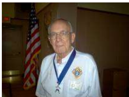
We Thank You!