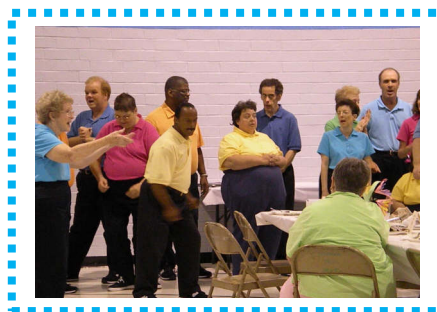
Celebration Singers December 16, 2008